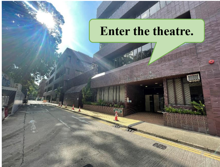
13 Arrive at Rayson Huang Theatre, 1/F, Runme Shaw Building